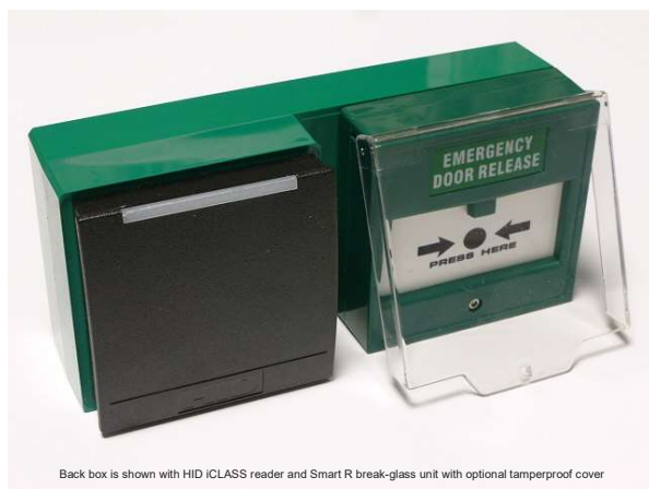
Back box is shown with HID iCLASS reader and Smart R break-glass unit with optional tamperproof cover

Spacer included to optimise device height